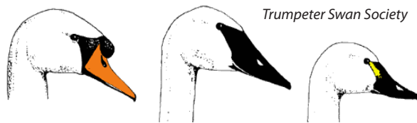
Mute Swan Trumpeter Swan Tundra Swan

The most notable difference between the mute swan and the two native swan species found in Michigan (trumpeter swan and tundra swan), is that adult mute swans have orange bills.